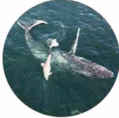
Whales and Dolphins