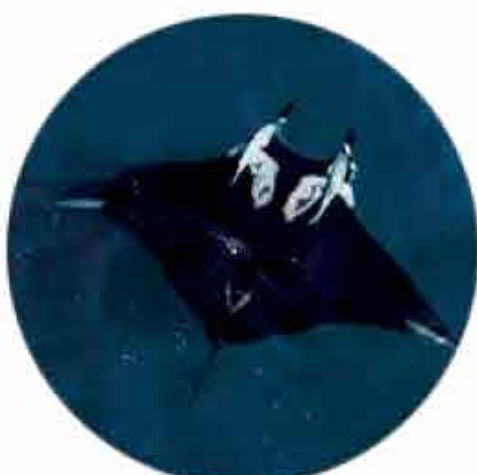
Giant Manta Rays